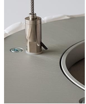
Figure 4 (correct cable position)

Your luminaire is now ready to turn on and be experienced!